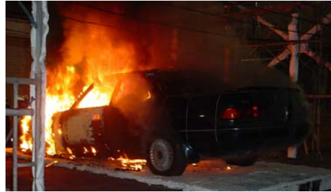
Figure 1. Tests by BRI of engine compartment fire -20 minutes after fire initiation.

Southwest Research Institute summarized eleven series of automobile fire tests conducted in the United States, Europe and Japan [Janssens, 2008]. The data generally confirmed the high intensity of fires that burn the materials in the occupant compartment. Figures 1 and 2 show typical test results from a series of vehicle fire tests conducted in 2002 by the Building Research Institute (BRI) in Japan. Figure 1 shows the progression of an engine compartment fire 20 minutes after ignition. Figure 2 shows the same fire at 30 minutes when the occupant compartment is totally engulfed in flames.