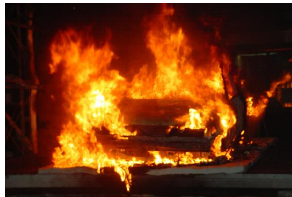
Figure 2. Tests by BRI of engine compartment fire -30 minutes after fire initiation.

Rescue data from FARS showed that in rural crashes, the 75 percentile rescue time was 24 minutes [Digges, 2005 ESV]. For urban crashes the equivalent time was 12 minutes. The survivability time measured in the GM vehicle burn tests was often less than that needed for first responders to reach a typical rural accident scene and begin rescue operations for trapped or incapacitated passengers.