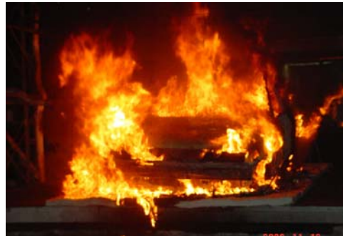
Figure 2. Tests by BRI of engine compartment fire -30 minutes after fire initiation.

Rescue data from FARS showed that in rural crashes, the 75 percentile rescue time was 24 minutes [Digges, 2005 ESV]. For urban crashes the equivalent time was 12 minutes. The survivability time measured in the GM vehicle burn tests was often less than that needed for first responders to reach a typical rural accident scene and begin rescue operations for trapped or incapacitated passengers.