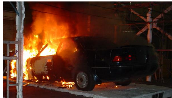
Figure 1. Tests by BRI of engine compartment fire -20 minutes after fire initiation.

Southwest Research Institute summarized eleven series of automobile fire tests conducted in the United States, Europe and Japan [Janssens, 2008]. The data generally confirmed the high intensity of fires that burn the materials in the occupant compartment. Figures 1 and 2 show typical test results from a series of vehicle fire tests conducted in 2002 by the Building Research Institute (BRI) in Japan. Figure 1 shows the progression of an engine compartment fire 20 minutes after ignition. Figure 2 shows the same fire at 30 minutes when the occupant compartment is totally engulfed in flames.